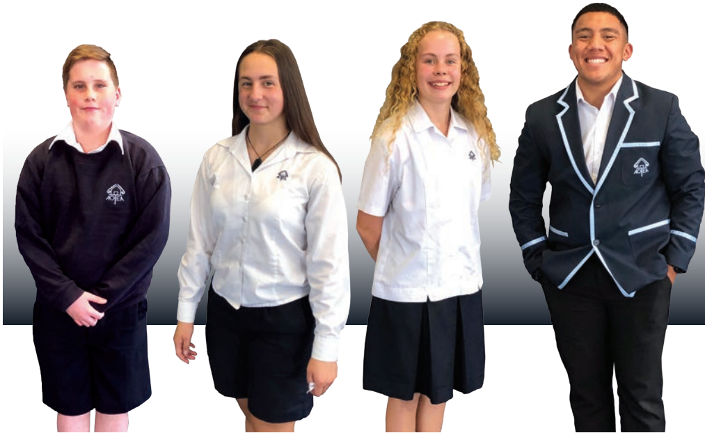
Pictured: Girls – School crested white shirt with school navy pleated skirt, shorts.

Uniform is purchased online through Argyle Schoolwear. Their website www.argyleonline.co.nz