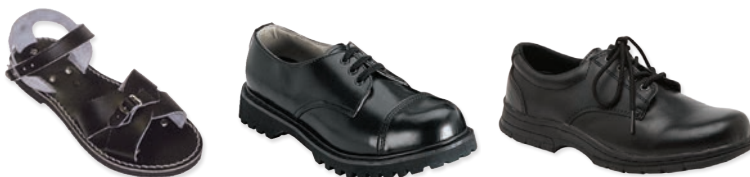
Pictured: Accepted plain black leather lace up shoes and black sandals with a back strap (Roman sandals)

Plain black leather 'look' lace up shoes Black sandals with a back strap (i.e. Roman sandals)