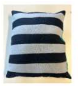
Highly Commended Chloe Brightwell (Southland Girls High School)