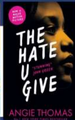
Black Lives Matter

These provide valuable different perspectives of society and are highly recommended reads.