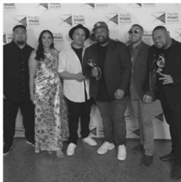
Tomorrow People, Best Pacific Music Album