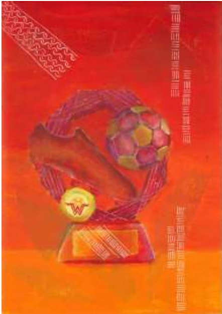
Lucas Woolf Y10 - Taonga painting